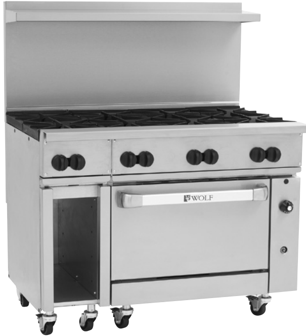
Model C48S-8BN (shown with optional casters)