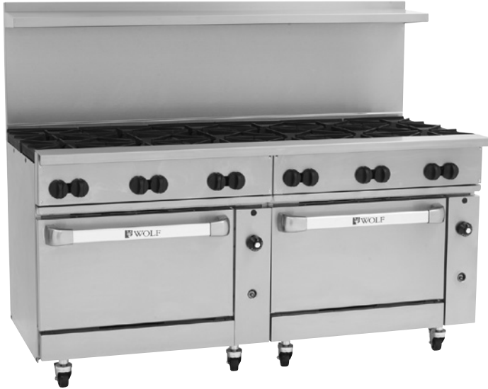
Model C72SC-12BN (shown with optional casters)