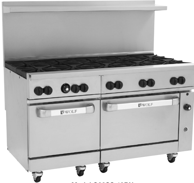
Model C60SS-10BN (shown with optional casters)