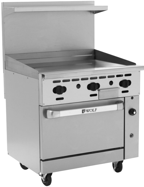
Model C36S-36GN (shown with optional casters)