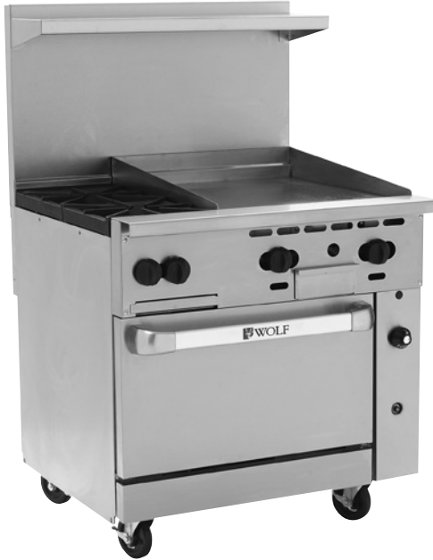
Model C36S-2B24GN (shown with optional casters)