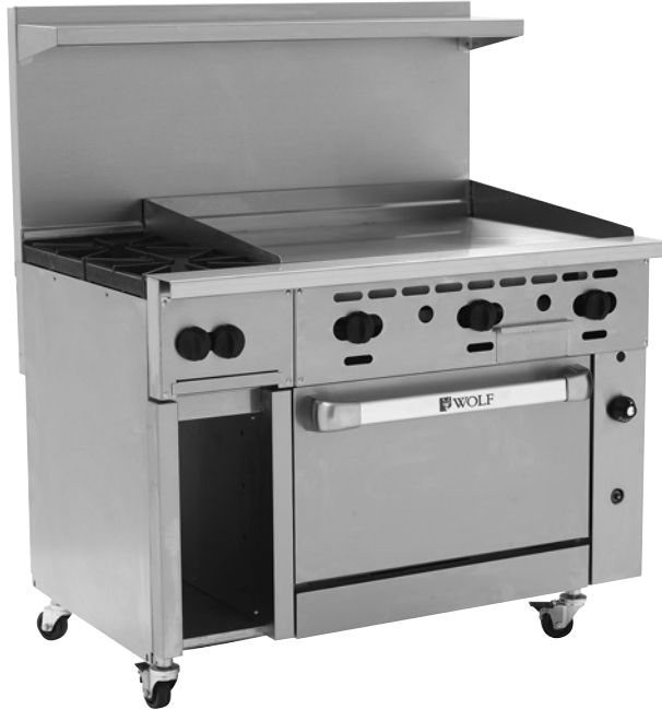
Model C48S-2B36GN (shown with optional casters)